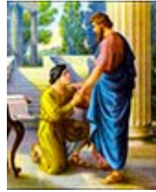
Saints Onesimus and Paul

Paul, a prisoner of Christ Jesus, and Timothy our brother, To Philemon our dear friend and co-worker, to Apphia our sister, to Archippus our fellow-soldier, and to the church in your house: Grace to you and peace from God our Father and the Lord Jesus Christ. When I remember you in my prayers, I always thank my God because I hear of your love for all the saints and your faith towards the Lord Jesus. I pray that the sharing of your faith may become effective when you perceive all the good that we may do for Christ. I have indeed received much joy and encouragement from your love, because the hearts of the saints have been refreshed through you, my brother. For this reason, though I am bold enough in Christ to command you to do your duty, yet I would rather