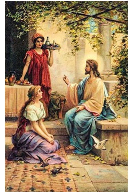
Mary and Martha